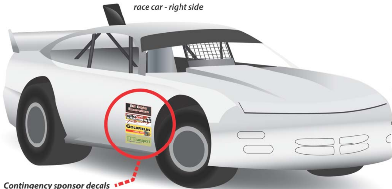
race car - right side

Contingency sponsor decals as close to the right hand front wheel as possible